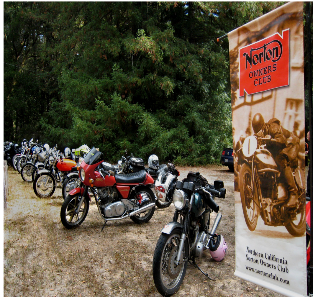
2010 AGM : Club bikes and riders gather at the October 3 General Meeting ,ride and BBQ, Huckleberry Flat in the San Mateo County Park.