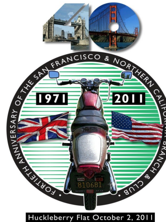
Huckleberry Flat October 2, 2011