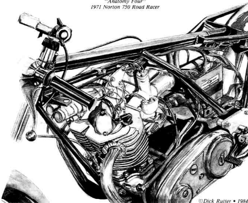
"Anatomy Four" 1971 Norton 750 Road Racer

THE NEWSLETTER OF THE NORTHERN CALIFORNIA BRANCH