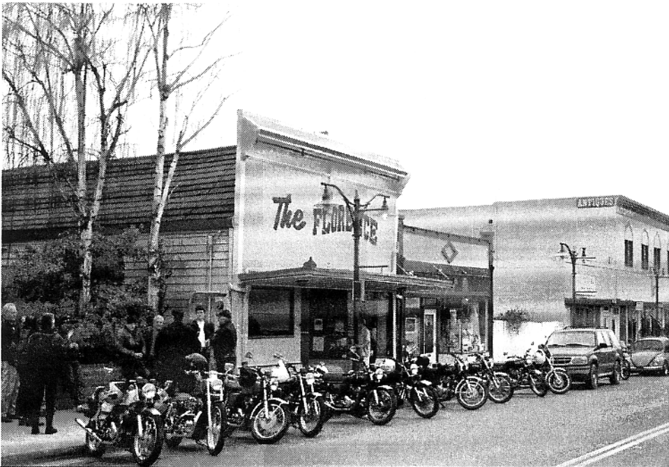
The lineup at the Florence for the Sweetheart Ride