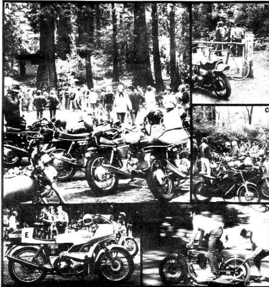
Scenes from the '78 Norton Beer Column