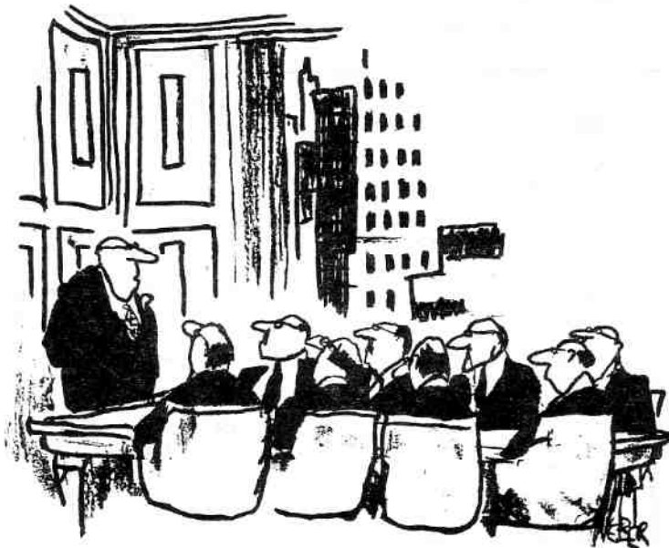
"We've had the T-shirts made, gentlemen. The question now is, shall we wear them?"

MY THANKS TO THE NEW YORKER FOR THE GOODIE HERE