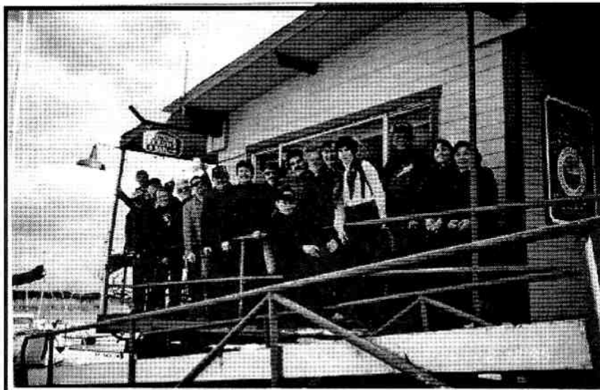
A Stop At The Rusty Porthole For Lunch!