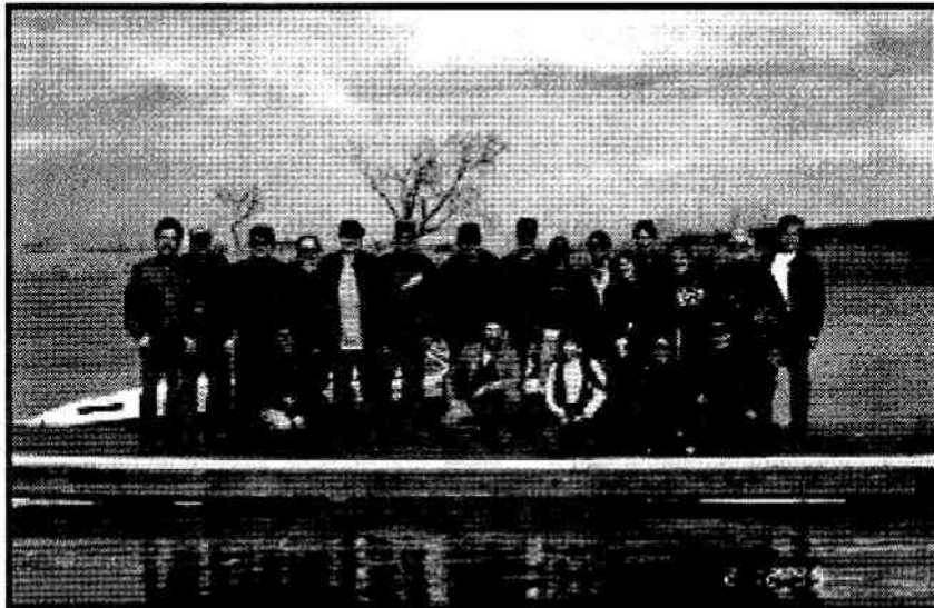
Shouldn't All That Leather Sink Like A Rock?