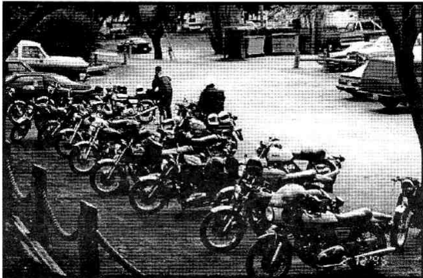
What a Great Turnout !!