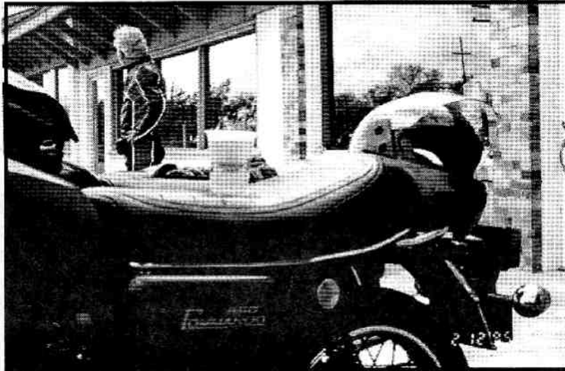
Time For Lunch!!